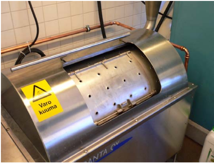
Illustration of the dyeing machine